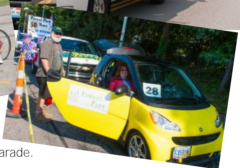
Forest Park Residents enjoyed the Northland Community 4th of July Parade.