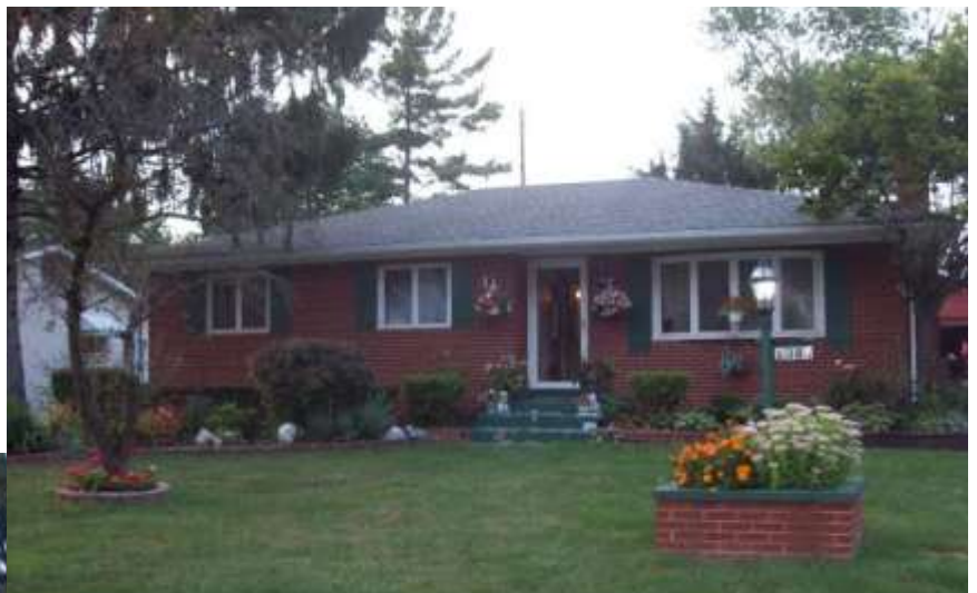
1384 Vinewood Dr.