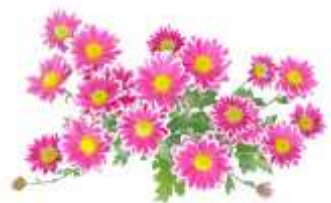
1386 Redwood Ct