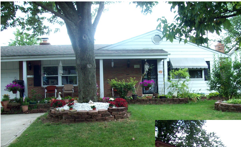
Forest Park East Winner 1627 Norma Road

Forest Park West winner photos are located on page 10.