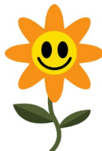
Forest Park East Winner 5301 Torchwood Loop

Forest Park West winner photos are located on page 10.