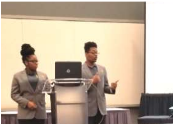
Beechcroft STEM students presenting their projects at Various conferences. Much time is spent outside the school day to complete projects.