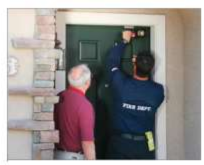
1. The Columbus Fire Department installs the Knox Box.