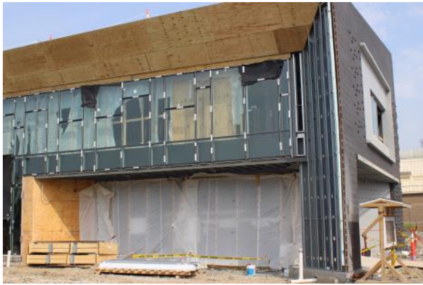
Construction Photos of the new version of the Karl Road Library. The old library will be torn down over the summer months