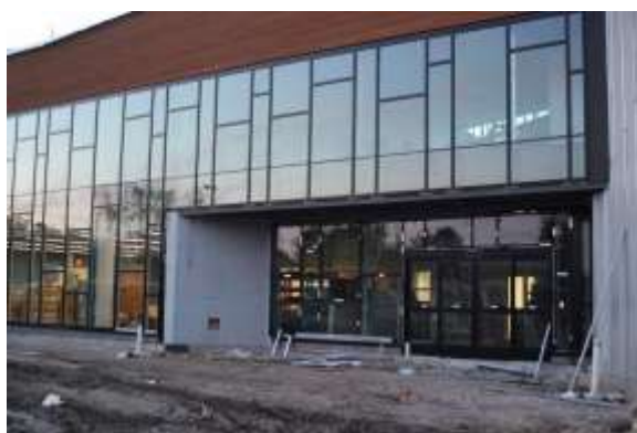
← The new Library