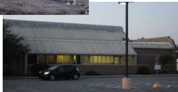
↘ and the old Karl Rd branch

Even with this library closed, families can still participate in the summer reading program. Check out the website for details.