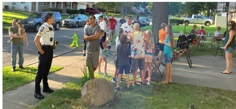
Neighbors hanging out for Jazz (below) & National Night Out festivities (above) Forest Park, Great Place to call Home!