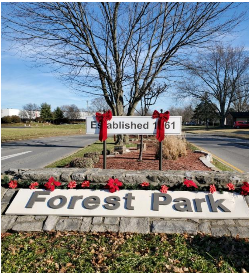
Forest Park decorated for the Holidays!!

FINANCING AVAILABLE NO PAYMENTS, NO MONEY DOWN FOR 1 YEAR (with approved credit)