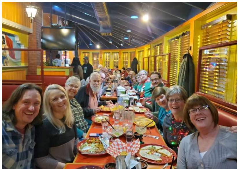
Forest Park members enjoyed a holiday dinner at Fiesta Jalisco on Dublin Granville Rd following their short December Meeting.