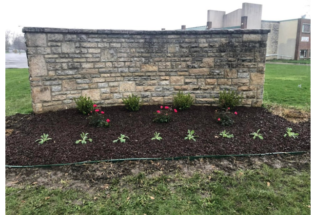
← The Before & After ↗