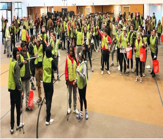
Students gathered at Dwell Community Church prior to their generous clean up efforts in the Northland neighborhoods on March 26th.