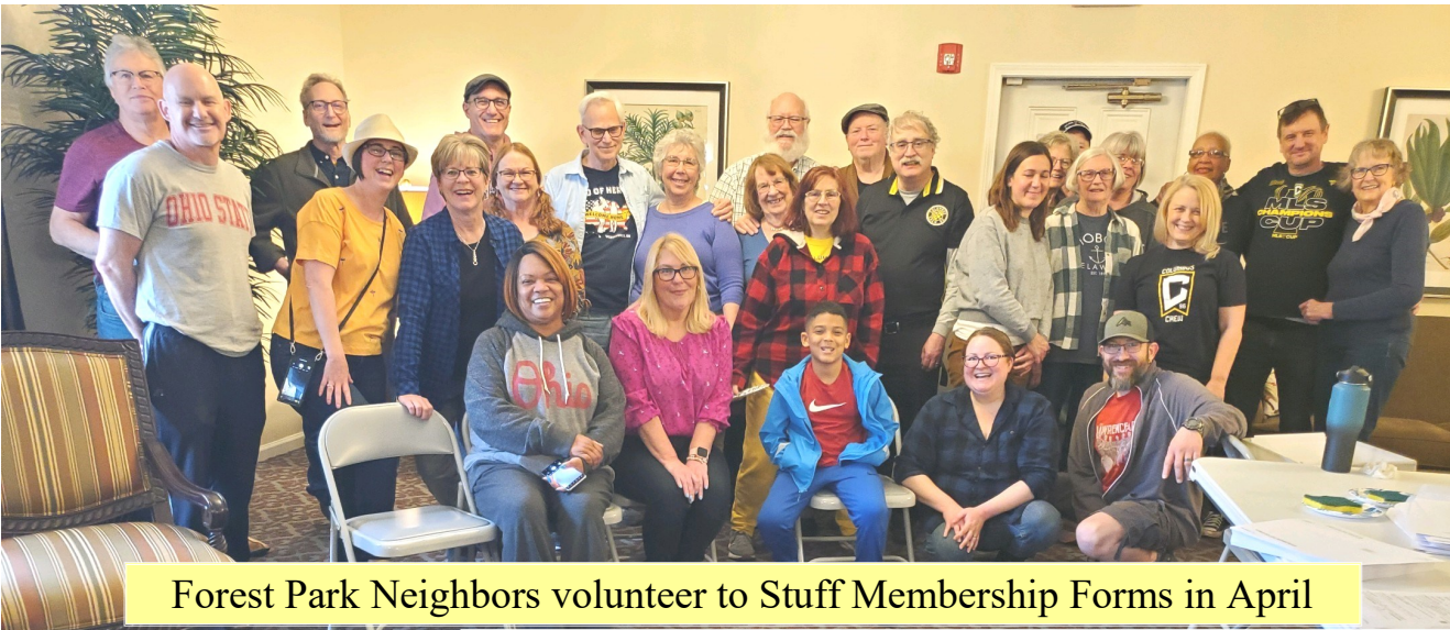
Forest Park Neighbors volunteer to Stuff Membership Forms in April