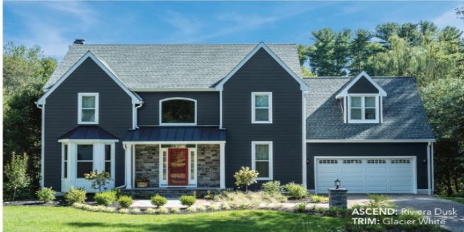
ASCEND: Riviera Dusk TRIM: Glacier White